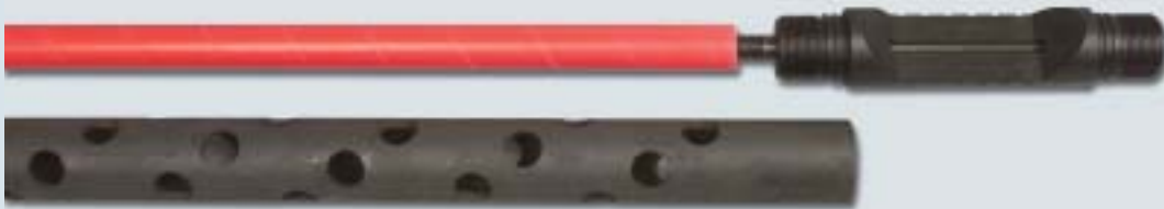
Well stimulation tool (WST) and hardware